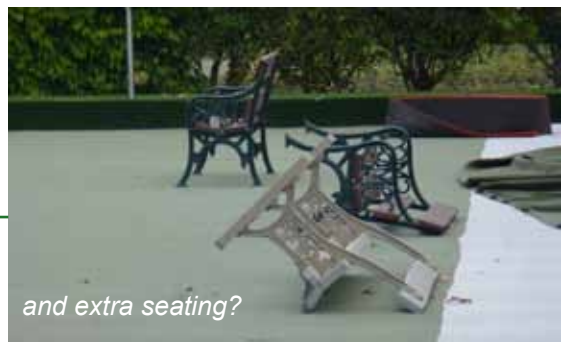
and extra seating?