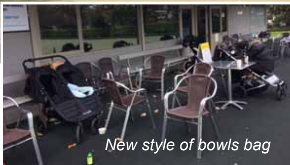
New style of bowls bag