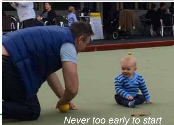
Never too early to start