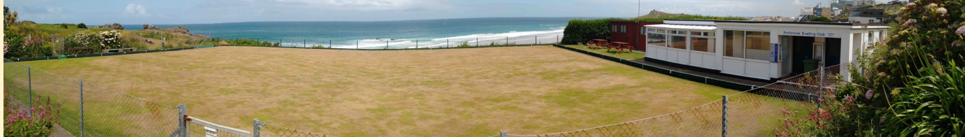
Porthmoe BC, St Ives, Cornwall