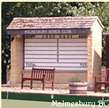
Malmesbury BC, Wiltshire