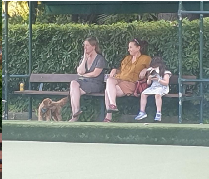
Tense spectators, spouses feel the players moments of success and disappointment.